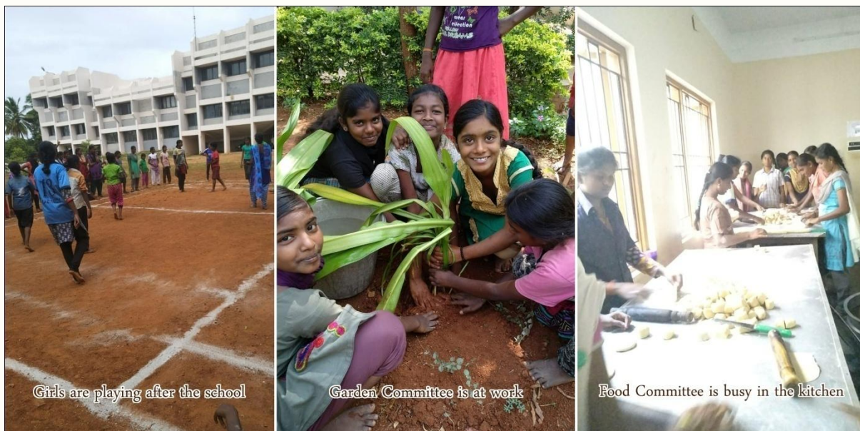
Girls are playing after the school