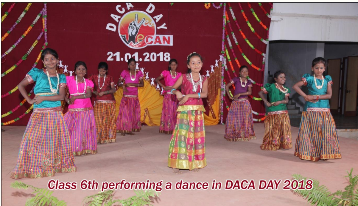
Class 6th performing a dance in DACA DAY 2018

for the day. He in his address encouraged the girls to consider their poverty, oppression and other sufferings not as blocks in their lives but as stepping stones for growth. The girls appropriately made use of the day to bring out their innate cultural skills and talents through various cultural events like dancing, singing, acting etc. All those girls who achieved in the field of education, sports and culture were honoured with prizes on the DACA Day. It was a beautiful occasion for all of us in the campus to celebrate our togetherness by sharing our joy and happiness with one another.