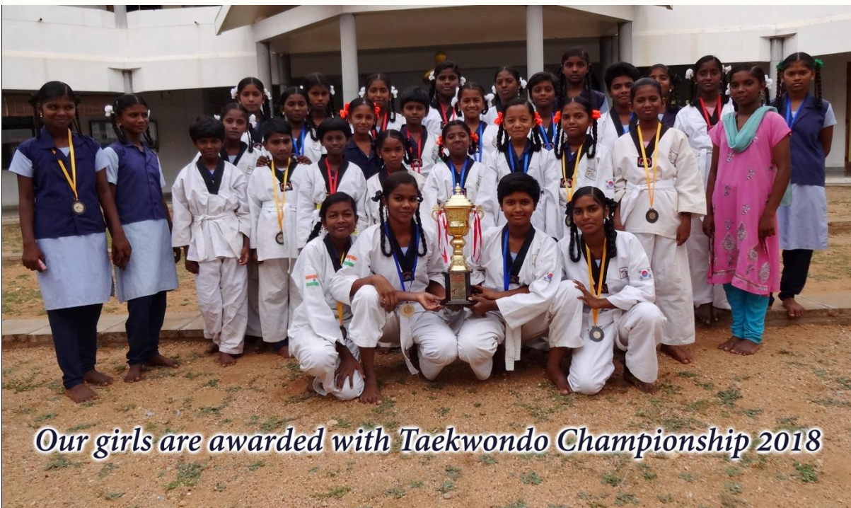
Our girls are awarded with Taekwondo Championship 2018